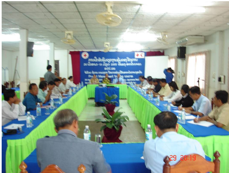
Project Management Training Course in Savannakhet Province