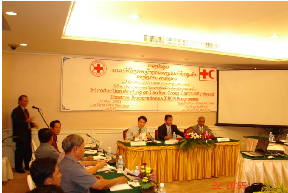
National Introduction Meeting on LRC CBDP Programme in Vientiane